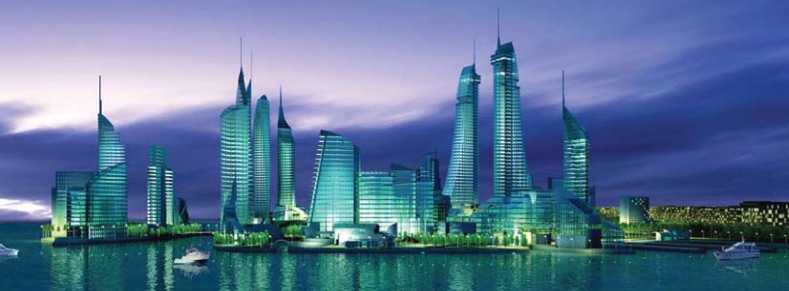
Financial Towers, Bahrain Letting agent