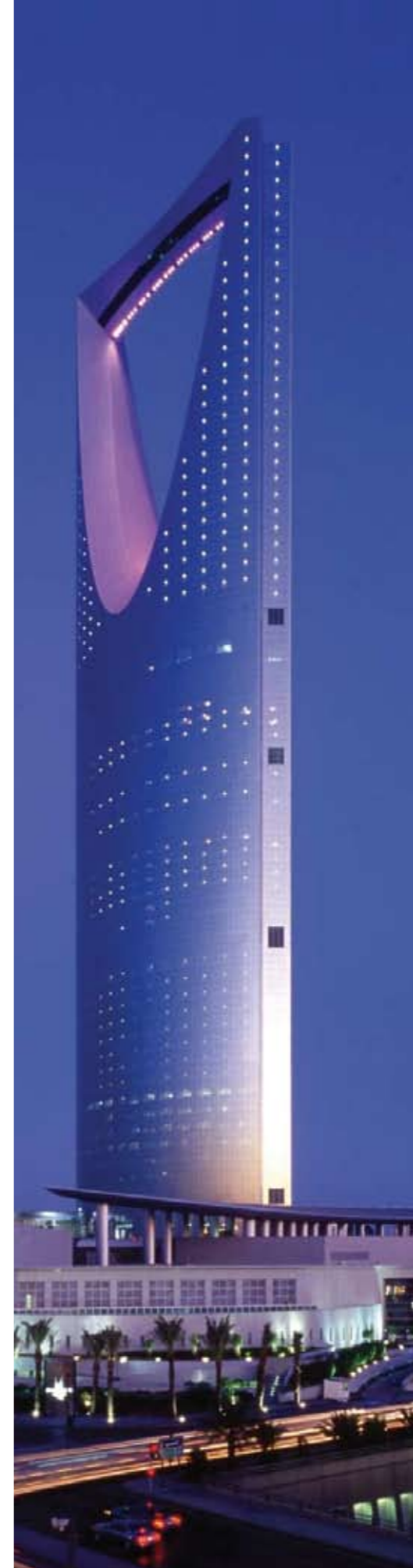
Kingdom Centre, Riyadh Facilities management consultancy