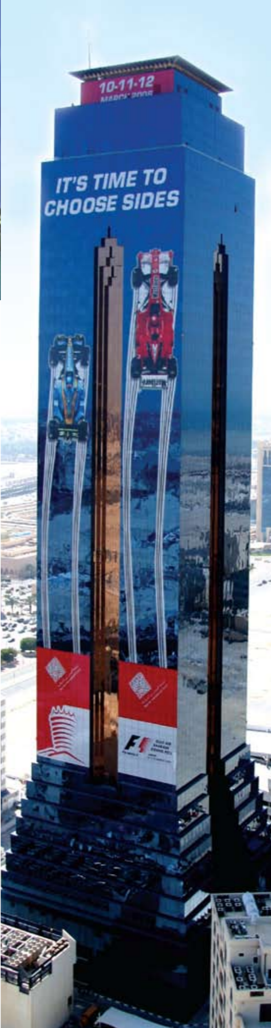
Almoayyed Tower, Bahrain Managing agent