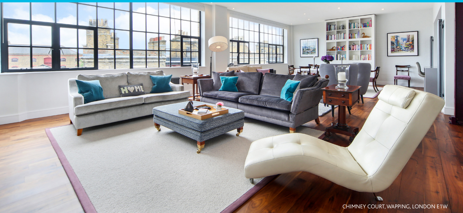
CHIMNEY COURT, WAPPING, LONDON E1W